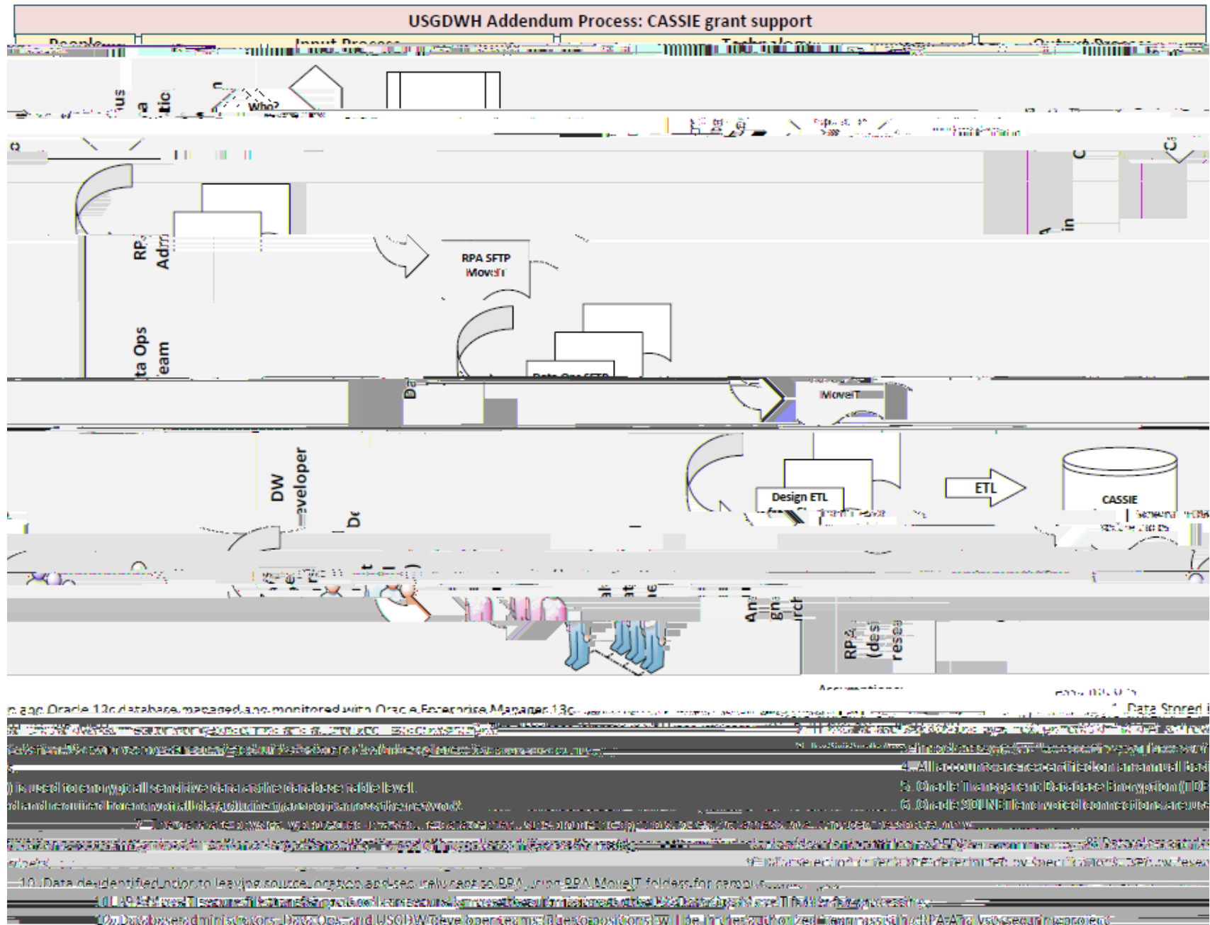
Figure 1: USGDW Addendum Process for CASSIE Project