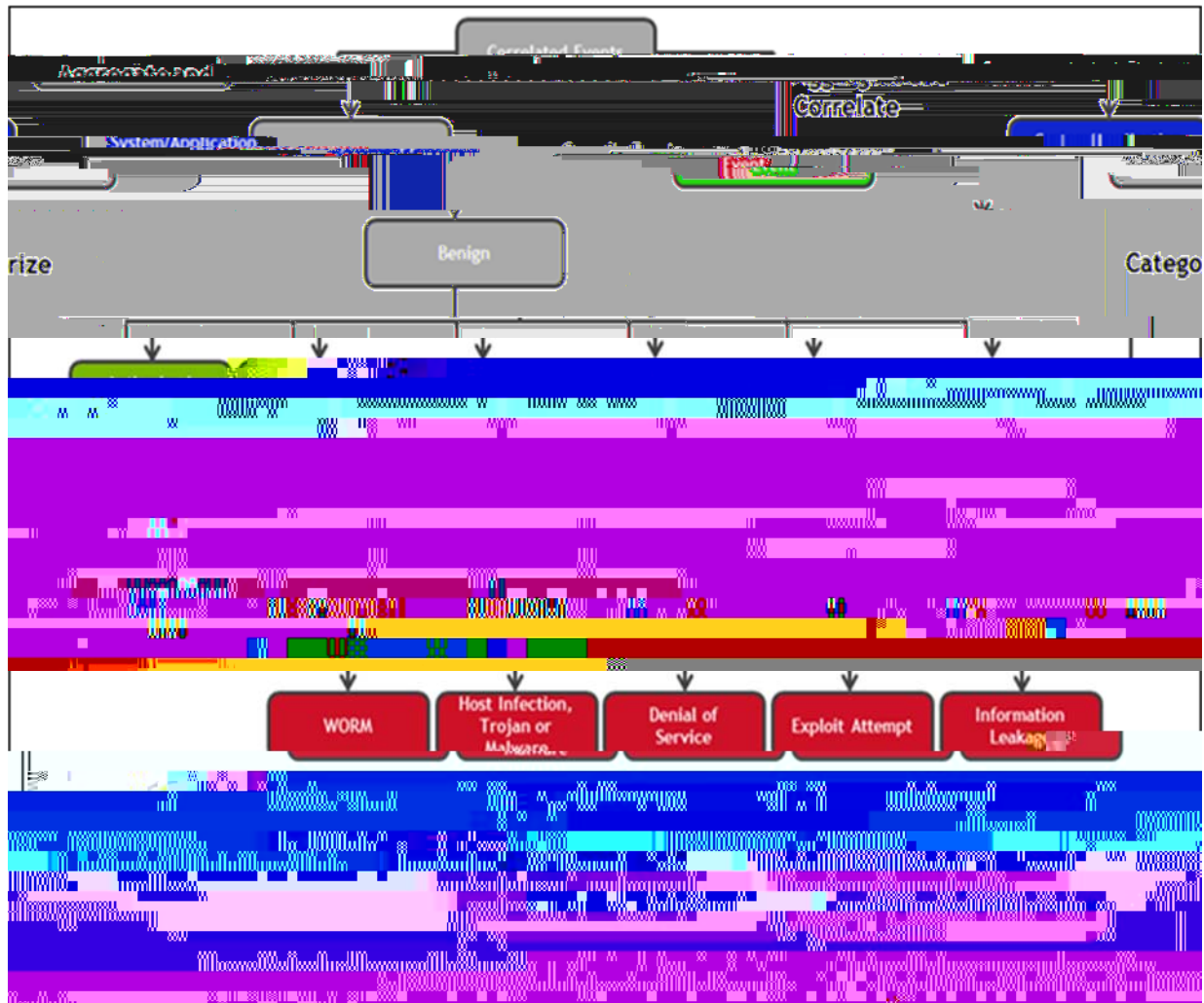
Figure 2: Event Handling Process